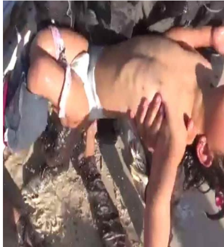
V-005 @ 01:40

The toddler is being dramatically snatched up off of the bed of a truck by a White Helmets guy who then, with the cameras whirring, runs off with her towards no where in particular and for no discernable reason. The child's color is amazingly rubicund, which means 100% that she is not a victim of a sarin attack -- not a sarin attack by Bashar al-Assad or by anyone else. Ivanka and Donald T. Dildo, for all of their apparent concern for children, need to STFD and STFU until they understand the situation sufficiently to respond appropriately. They have already killed four Syrian children with their Tomahawk attack on al-Shayrat. They are not helping the situation.