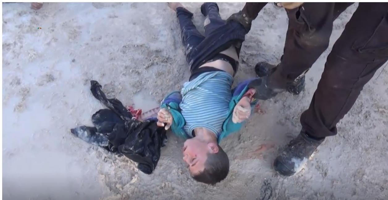
V-005 @ 01:40

the victims shown in the images under points #1, #2, #3, #4 & #5 above. All of them are “supposed” to be sarin victims. All of them are healthy pink. Or look at this youngster, who is shown in strong sunlight during the alleged KS sarin attack.