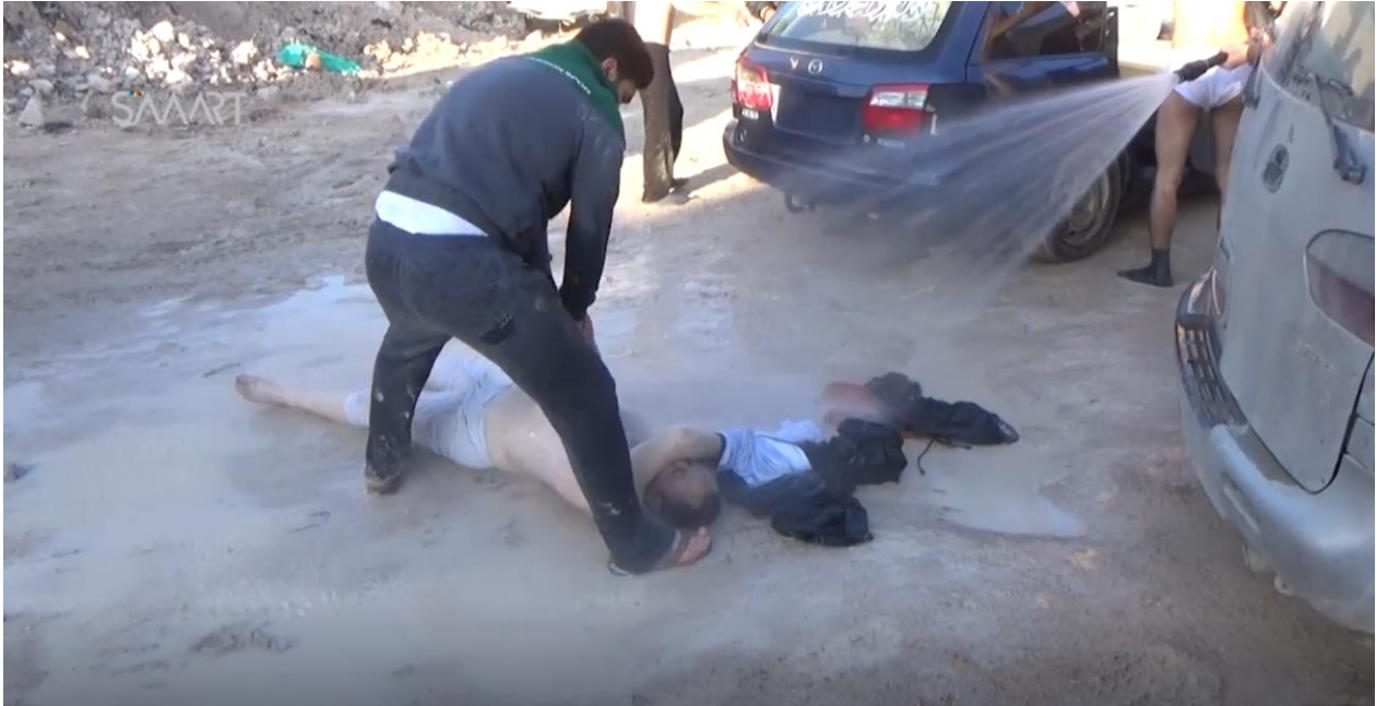
V-005 at 01:32, color enhanced