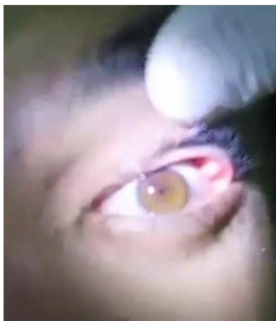
Vid-002 at 09:14

Nevertheless, it’s really the only symptom the terrorists have to convince the world sarin was used. And so in a lot of these terrorists’ vids — like V-002 — you will see radical, dangerous anti-Assad Sunnis like Shajul Islam shining flashlights in “victims” eyes to demonstrate pin-point pupils. But what they are actually demonstrating is that the victim was not exposed to sarin.