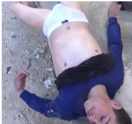
V-005 at 00:37

For these reasons, the lack of feces and urine staining a person's clothes is one of the most evident clues that the person has not been poisoned by sarin. For example, you can be absolutely certain that the young man shown in the screen grab below from vid V-005 was not intoxicated with sarin, contrary to what the video attempts to portray.