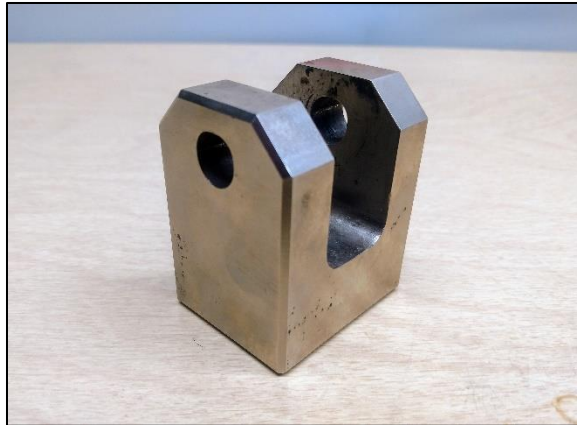
Figure 3 - Grip currently in use in the Fatigue & Fracture lab