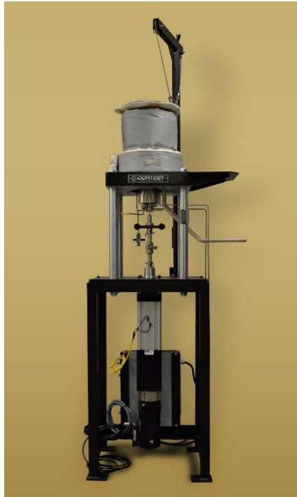
Figure 2 - Example of Cortest autoclave setup for fatigue testing