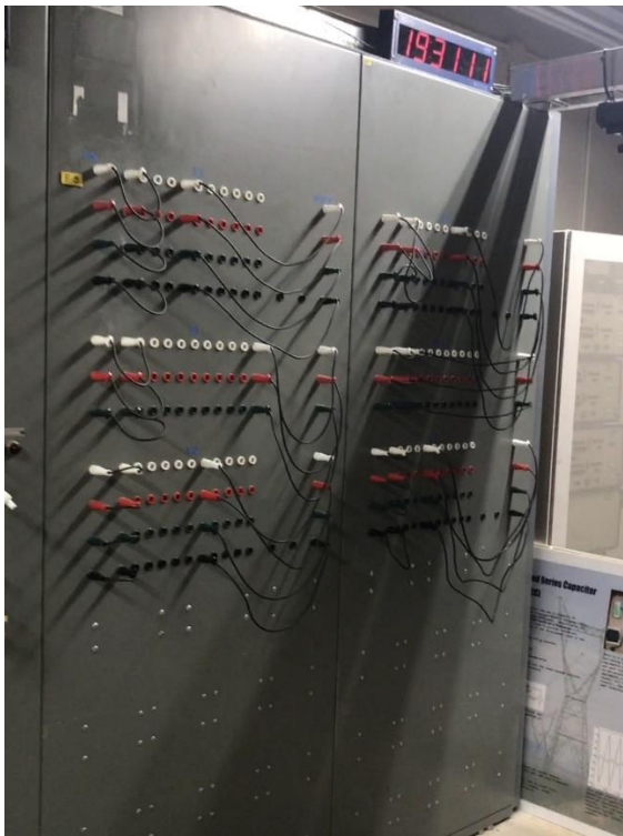
The control of impedences.