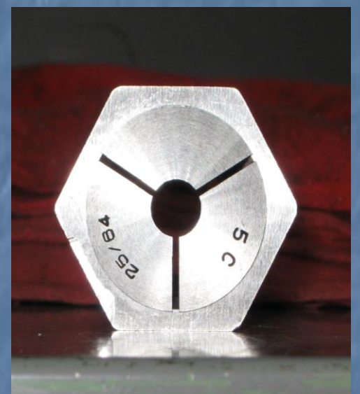
Fig 3 Front view of hexagonal collet; Stock goes into the middle hole