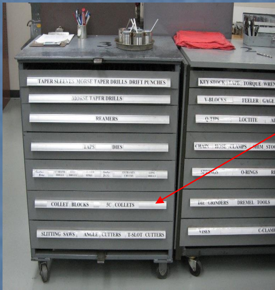
Fig 2 Cabinet 3 next to the HAAS Mill