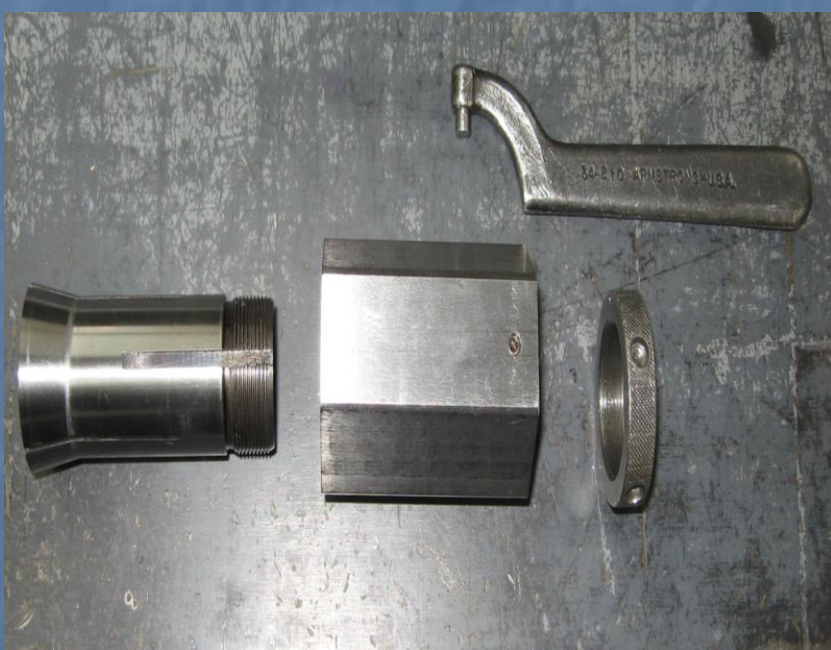
Fig 4 Disassembled view of collet block; left to right from top; collet wrench for tightening, collet that holds stock, block for mounting, and collet ring that screws into collet