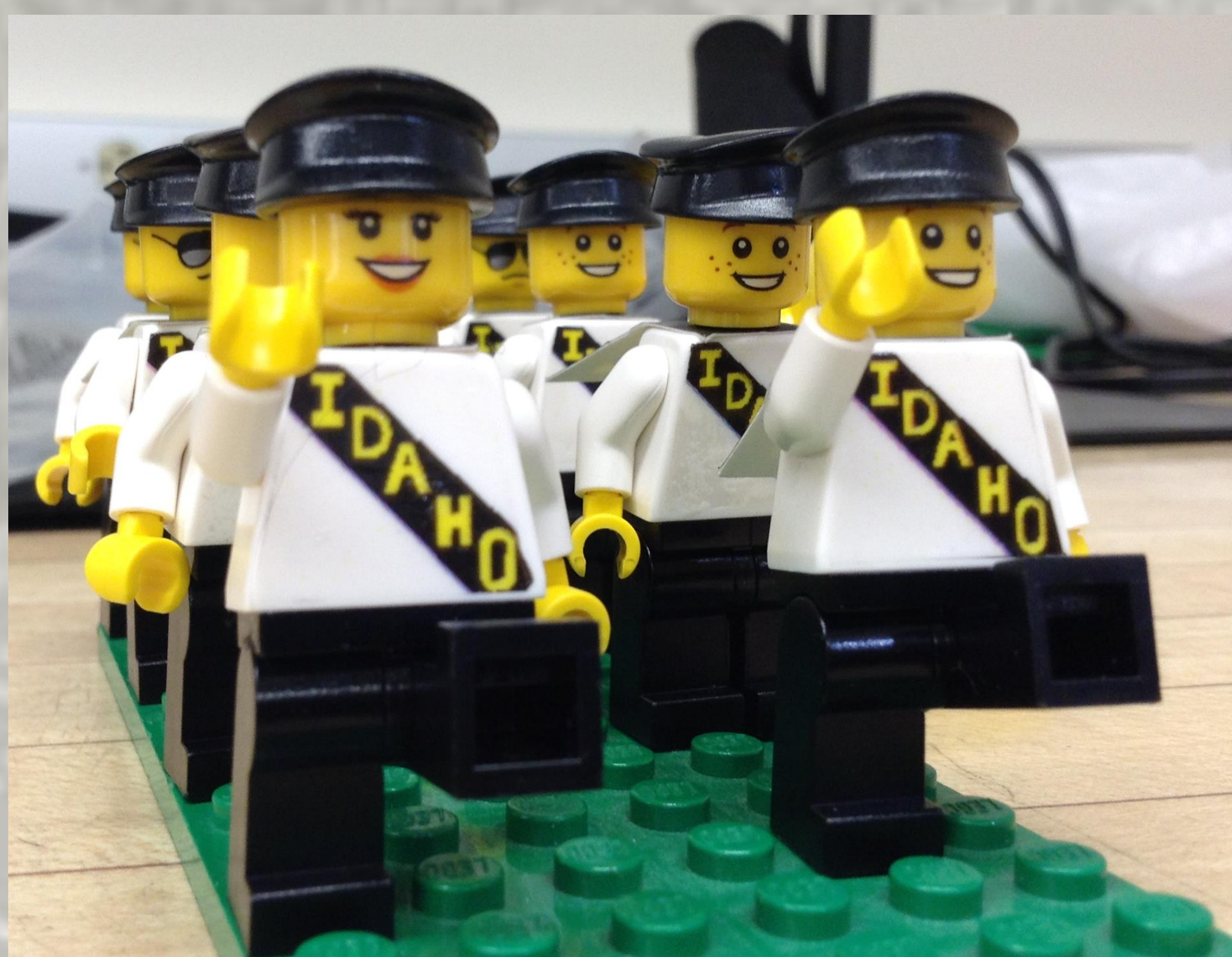
Custom decals were created to replicate the uniforms of the band.