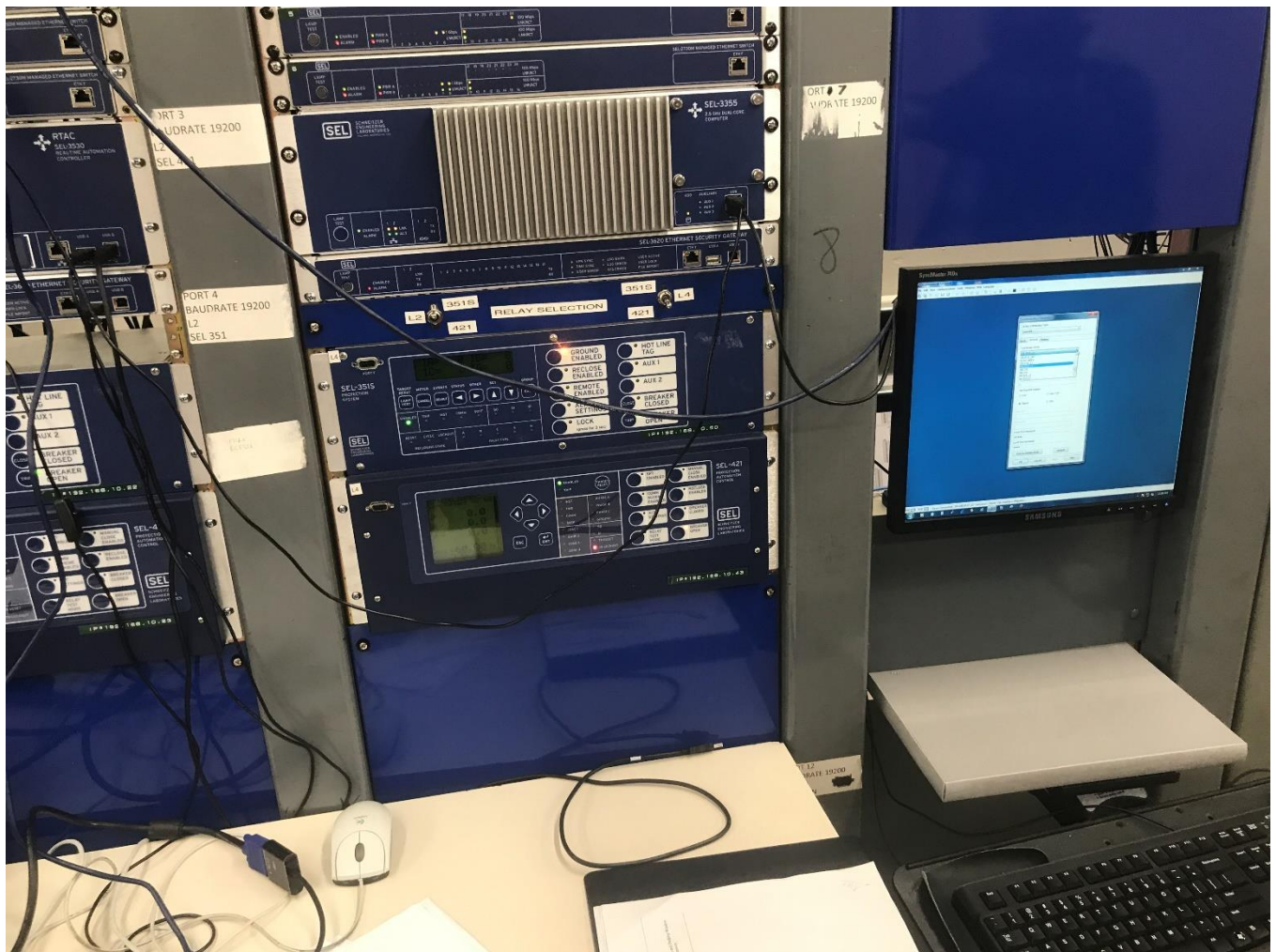
The Real-Time Automation controller we use in the lab. It's called SEL 251S L2.

Use the Samsung computer to control the Real-Time Automation Controller.