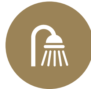
THE SPRAY SYSTEM