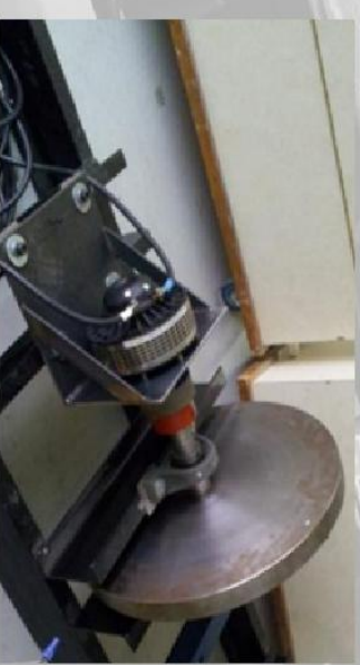
Flywheel Platform with Lynch Motor