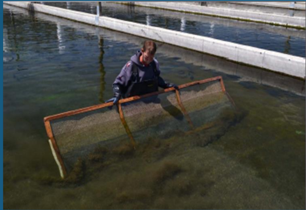
Push Screen Method