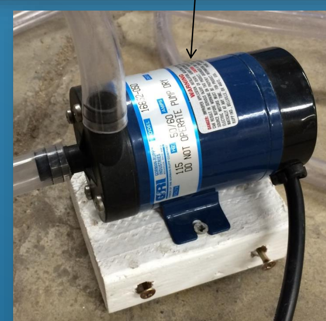
2.25 gpm Centrifugal Pump