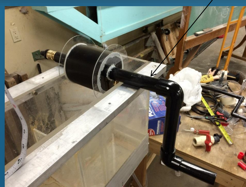
Reel w/ Built-in Outlet