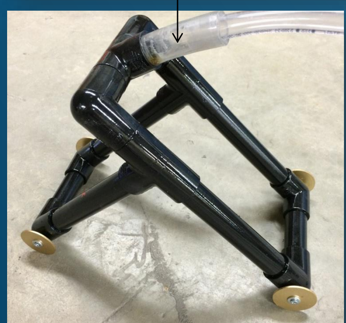
PVC A-Frame Design