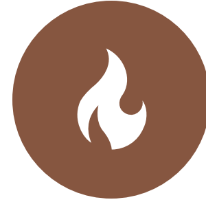
THE HEAT SOURCE