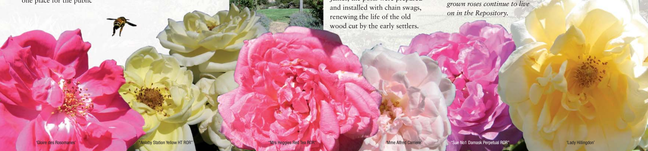
‘Gloire des Rosomanes’