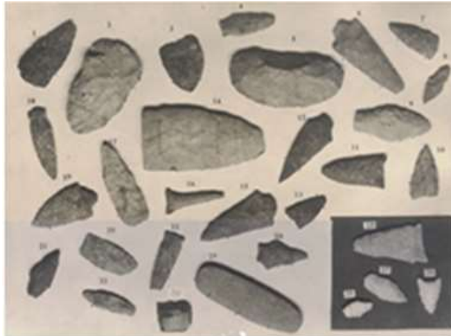
Key to the Palmer Collection of Native American Artifacts when on display in the Hunnewell Building from 1940s through 1970s