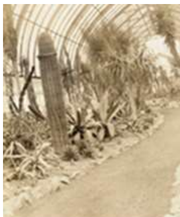
Missouri Botanical Garden E.J. Palmer 4/3/1924