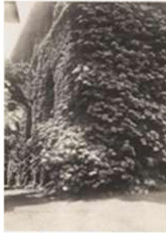
Hydrangea petiolaris Hunnewell Building E.J. Palmer 6/20/1947