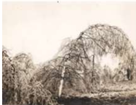
Birches after a sleet storm Arboretum E.J. Palmer n.d.