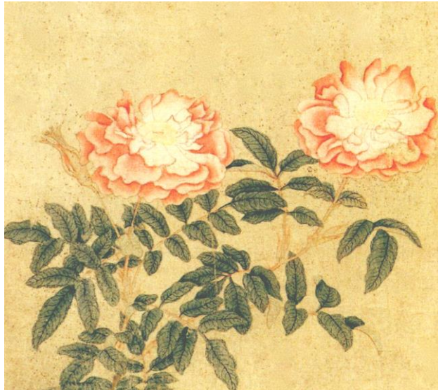
Fig.1 A variety of Rugaosa with double flower, painted by Quan Xuan (1239—1299) , at least 700 years ago