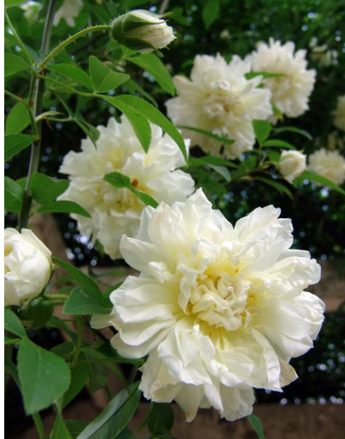
Fig.3 The existing rare Tumi, the best climber for corridor decoration in a Chinese traditional garden.

a scroll titled one hundred flowers , painted in Southern Song Dynasty, more than 700 years ago.