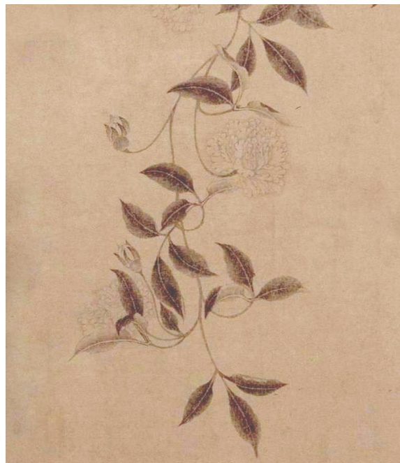
Fig.2 Tumi on the ancient Chinese traditional flowers and birds painting,