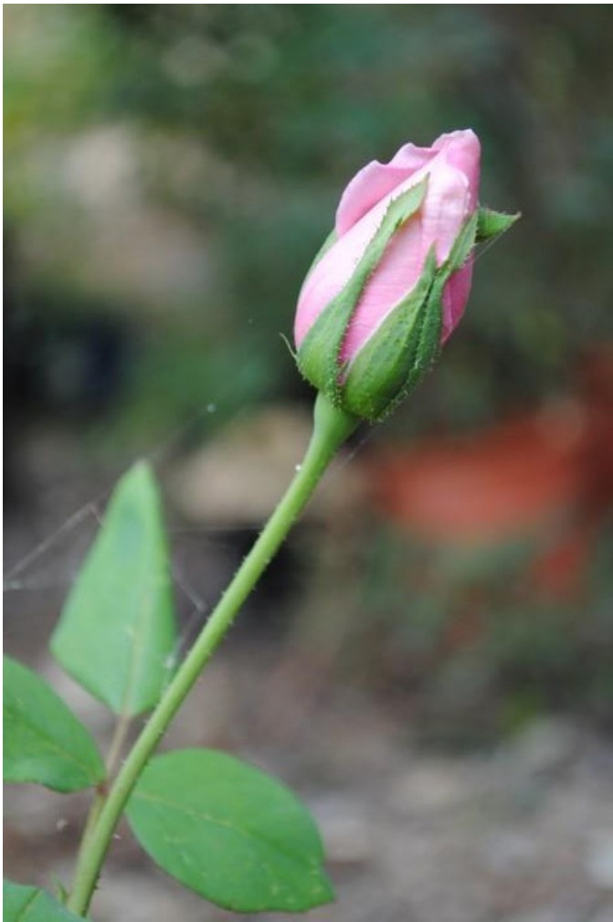
10.1.18 2" bud