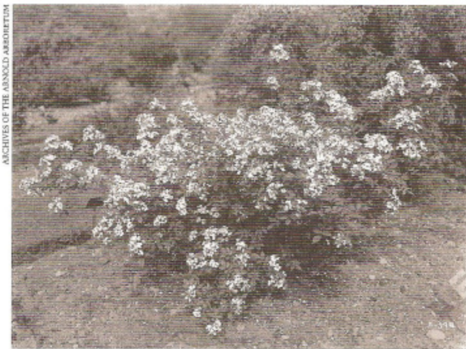
Rosa helenae blooming at the Arnold Arboretum.