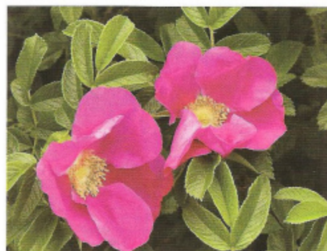
Rugosa rose ( Rosa rugosa ) has fragrant, colorful flowers, attractive foliage, and extremely well-armed stems.