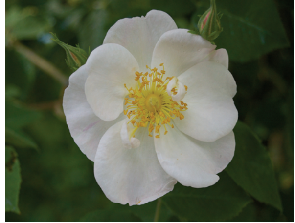
'Dupontii' [perhaps descended from R.gallica x R. moschata hybrid]