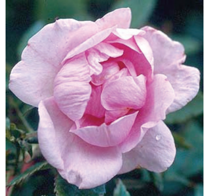
'D'Orsay Rose' No parentage given