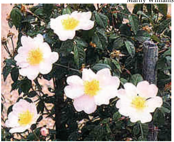
'Polliniana' [R arvensis x R. gallica]