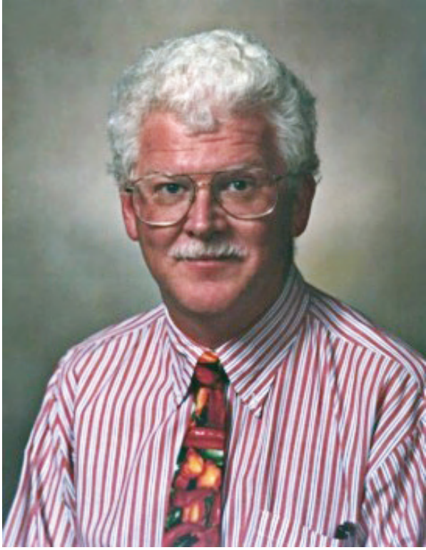
although we have not heat treated any new roses in several years.

We're very predominantly an undergraduate teaching institution, so there is not a lot of other research happening in our department. We do maintain an arboretum of citrus varieties on the campus, as well as teaching plots of various turfgrasses, but not really research projects. Then of course we have had a rose mosaic virus heat therapy program on campus, founded in the mid-1980s, and we still maintain the virus-free variety collection for distribution to nurseries,