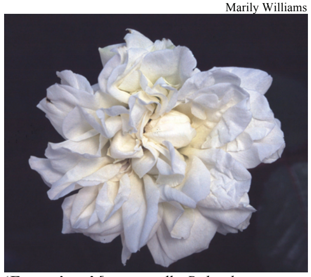
'Fortuniana' [ supposedly R. banksiae x R.laevigata

None of these is a cure-all for classifying Miscellaneous OGRs, but taken together they would go a long way toward moving disputed varieties into other classes. A final strategy would be that, for those few varieties that could not be sorted by one or more of the above methods, they simply be classed as a shrub. Anathema, you say?! Well, consider this: there are approximately 150 species roses recognized by the majority of taxonomists today. Of this number, the hybrids of Rosae gigantea, kordesii, moyesii, moschata, rugosa, and wichurana are already classed as (Classic) shrubs in the Modern Rose section of the ARS Classification scheme. This is because, with the exception of R. moschata in 1540, all of their dates of discovery or introduction fall after 1867, the "magic" date for the separation of OGRs and Modern Roses.