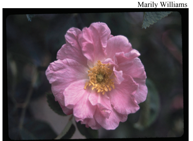
'Duplex' [ R. pomifera hybrid ]

Given this atmosphere of information and inquiry, coupled with near-instantaneous communication via the internet, I would propose that the Miscellaneous OGR class has become obsolete, a sort of dumping ground for roses that could, and should, be placed into existing categories, and that the class should be dropped. As it stands, it is a tacit admission that we, the ARS, the International Cultivar Registration Authority - Rosa, doesn't know or can't decide what to do with these roses, so we'll just sweep them under the rug for now. Rather than this approach, the ARS should be aggressively taking the lead and placing these "miscellaneous" roses into the class that is most appropriate, given the current classification system and the present state of rose research and scholarship.