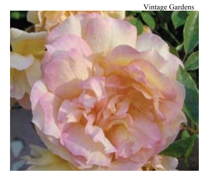
'Fortune's Double Yellow'