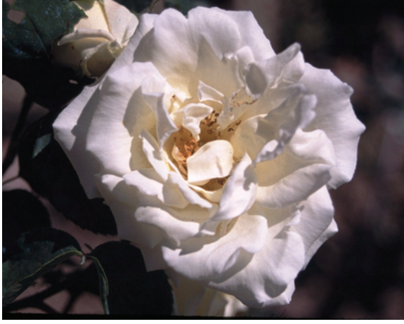
'Blanc Pur' 1827 Mauget No parentage given