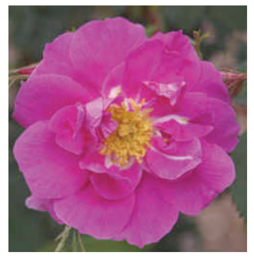
'Rose d'Amour' No parentage given

The Old Garden Rose & Shrub Journal is an official publication of the American Rose Society. It is published quarterly and posted as a link on the ARS website. Passwords for the Journal and other Members Only features are printed on the table of contents of each American Rose magazine. Submissions, comments or questions should be sent to: