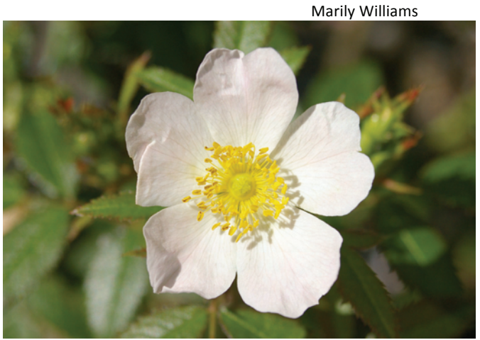
R. micranthosepium [R.agrestis x R.micrantha]