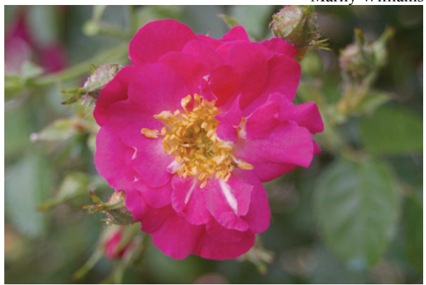
'Francofurtana' [probably R. cinnamomea x R.gallica ]

Consider further that the hybrids of Rosae bracteata, chinensis, eglanteria, foetida, gallica, multiflora, sempervirens, setigera, and spinosissima are presently classed as Old Garden Roses. What then of the hybrids of the other c. 135 species which date prior to 1867? They are shunted off into other, modern rose classes, primarily those of Large Flower Climber and Shrub. This is because