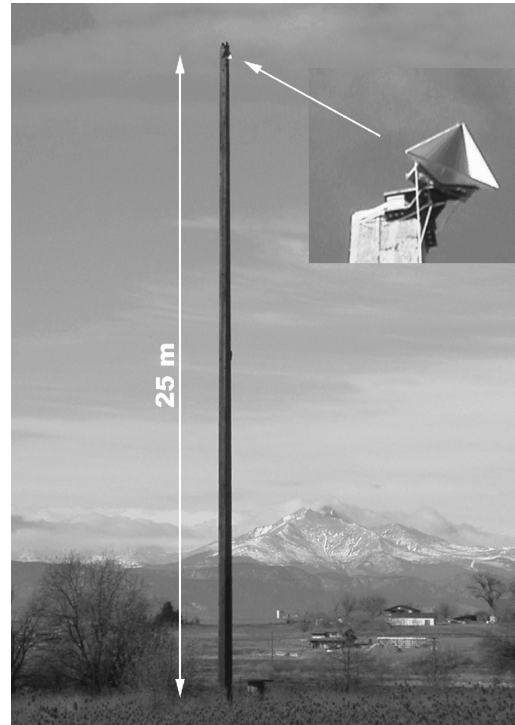
Figure 1. Photo of the trihedral reflector atop the wooden pole at the Erie-1 site. Longs Peak is in the distance and a close-up view of the reflector is in the insert at the upper right. The radars are located several hundred meters behind the camera.

----- Corresponding author's address: Brooks Martner, NOAA/ETL, 325 Broadway, Boulder, CO 80305. E-mail: brooks.martner@noaa.gov