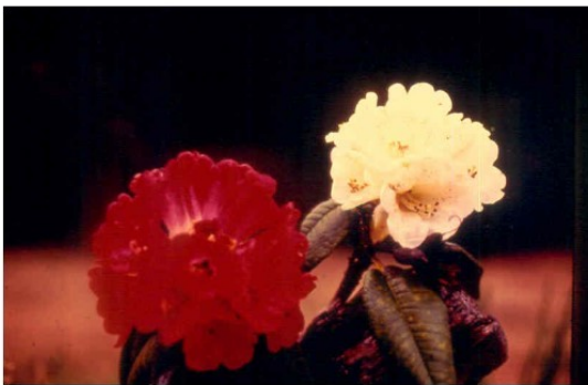
Red and White forms

distinctive, flowering in late autumn rather than in late winter, like the typical species, and with foliage closely resembling R. arboreum of the Himalayas. It has been registered with the International Registration Authority as R. arboreum ssp. nilagiricum . 'Tarun'.