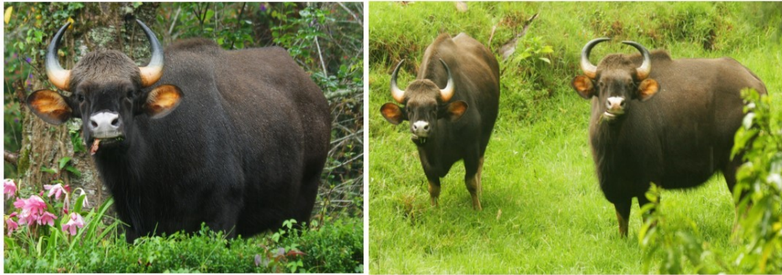
Gaur ( Bos gaurus ) seen within town limitativ

The consequences of this conversion of grasslands are immediate and obvious. One very serious effect is that animal species like the gaur are deprived of fodder and therefore invade cultivated lands, thereby intensifying man-animal conflicts. This factor, along with unplanned agriculture expansion, cutting across elephant corridors, and increasing elephant attacks on farmlands has led to serious alienation of the local community from efforts to protect the forests. No conservation programme will be successful unless it has the whole-hearted support of the local community - and this is an entirely man-made dilemma. Such considerations have come in the way of a proposal to notify a Palni Hills Sanctuary, pending for more than 10 years.