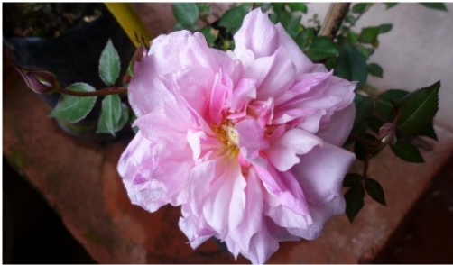
Reve d'Or x Pink Surprise (R.bracteata x R.rugosa)

The golden shades apart, we have to consider what can be done to create Tea etc roses in shades of lilac and purple as also in the orange colors. Some progress has been made using the Rugosa/bracteata Lens hybrid, 'Pink Surprise', crossed into Reve d'Or .