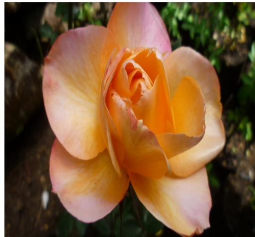
R.Gigantea seedling Effect of R.foetida genes

The genetic potential of the Tea rose line has perhaps been already fully exploited. So many hundreds of these classes have been raised and lost in the past. It is therefore necessary to bring in fresh blood and my new strains bring in the genes of Rosa clinophylla , perhaps the world's only tropical rose species, and of Rosa gigantea . The latter is for the reason that increasing the gigantea content of Tea roses seems to lead to better yellow shades. Indeed, Rosa gigantea is present in the old Tea roses, but somewhat distantly.