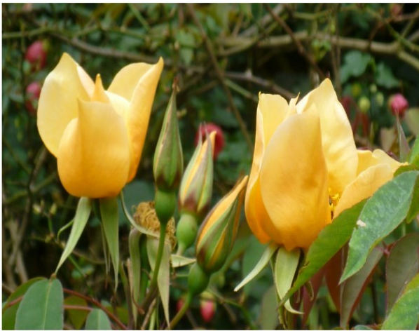
Amber Cloud Reve d'Or x R.gigantea Effect of R.gigantea

Apart from the introduction of R.foetida genes, fresh infusion of R. gigantea leads to brighter colors..