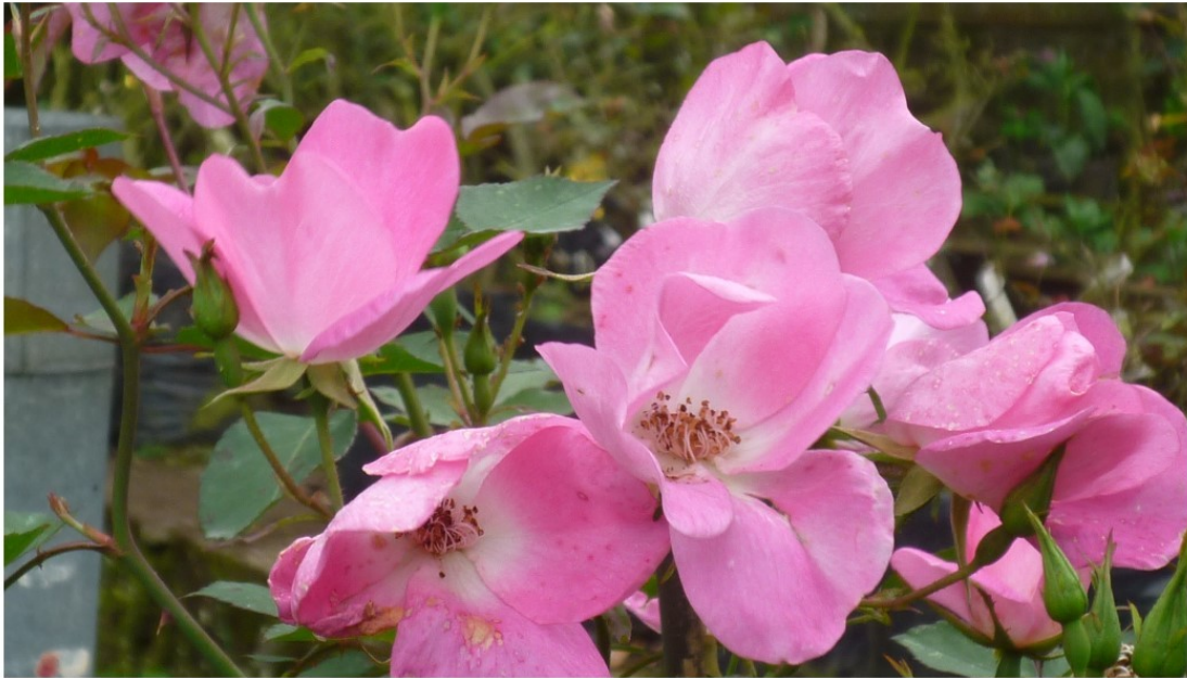
A Tea rose derivative X Laevigata rosea

No signs so far of the predicted storm. Perhaps it is the calm before the storm.