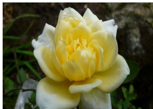
Rise'nShine x Tea / clinophylla seedlings